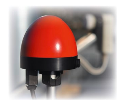
OTMC 100 - Mounting Example

The cable length to your closest network node can be up to 100 m for standard Ethernet infrastructures. By using additional optical Ethernet equipment, you can even extend this distance to several kilometers