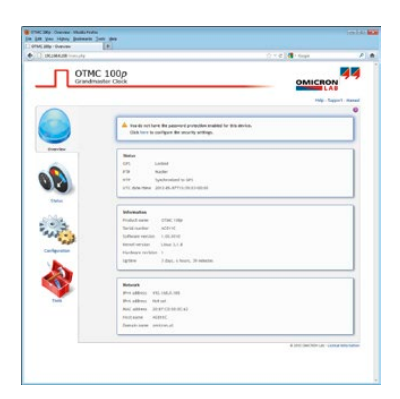
OTMC 100 - Web Interface

You can secure your OTMC 100 against unauthorized access by using the encrypted HTTPS protocol with your own SSL certificate and password protection.