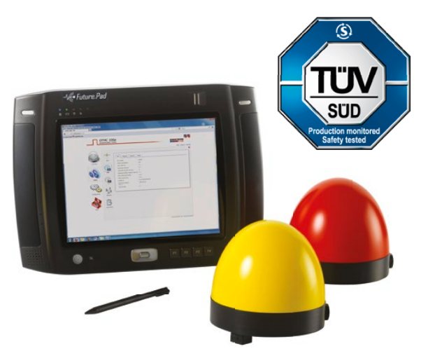
OTMC 100 Series with Tablet PC (PC not included)

Windows is a registered trademark of Microsoft Corporation.