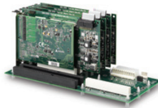
SSI bus cable for multiple cards synchronization

Termination Board with a 68-pin SCSI-II Connector and DIN-Rail Mounting (Including One 1-meter ACL-10568 Cable)