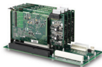
SSI bus cable for multiple cards synchronization

* Note: Analog output related pins on the DAQ-2213